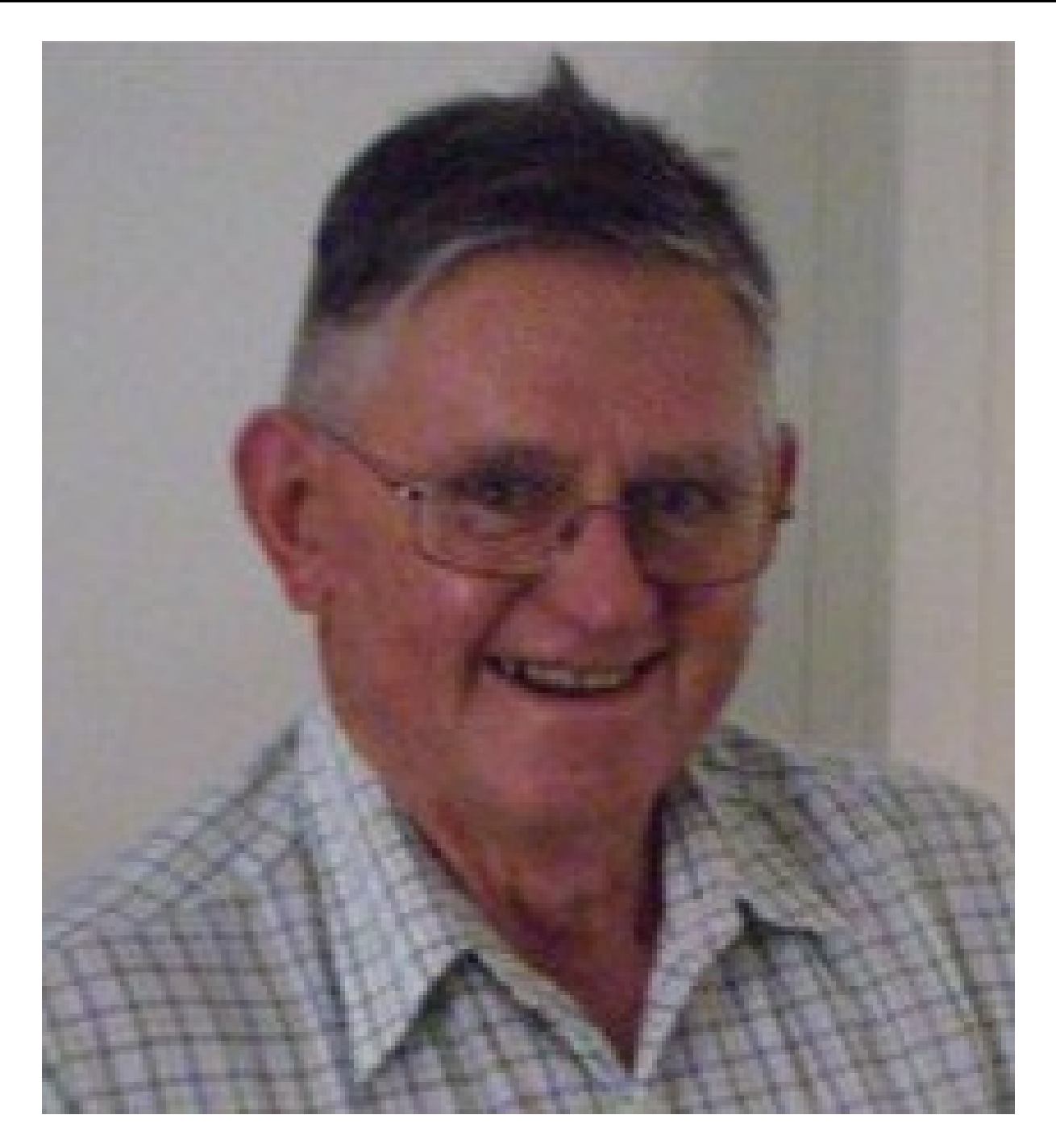
Thank you for your presence here today.

Your expressions of sympathy, support and friendship is greatly appreciated.